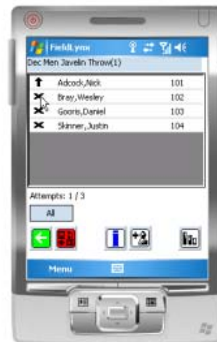
24 - One athlete checked in