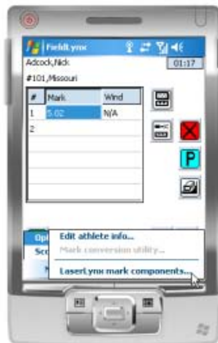
32 - Data for calculations is stored