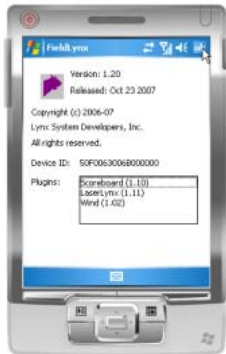
04 - LaserLynx plugin is available