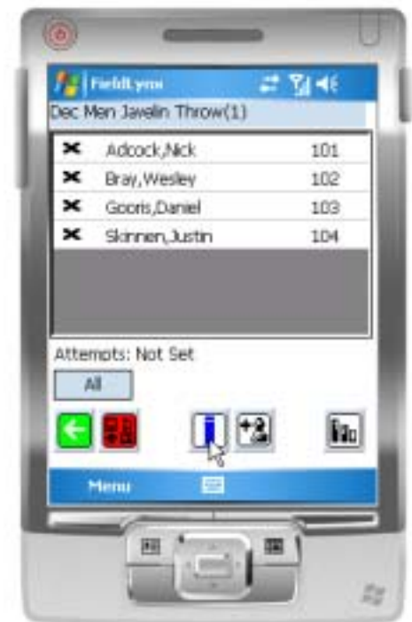
15 - Enter event details