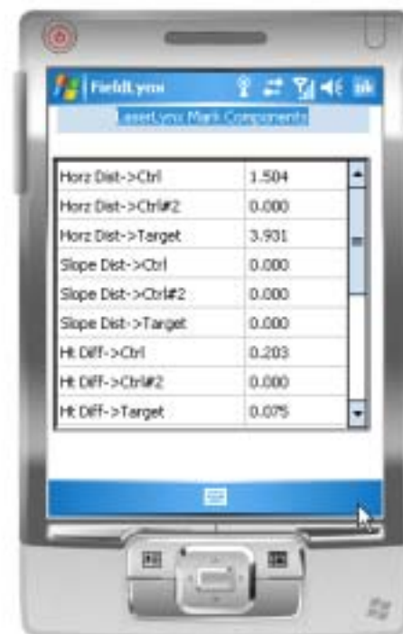
33 - ... and is available.