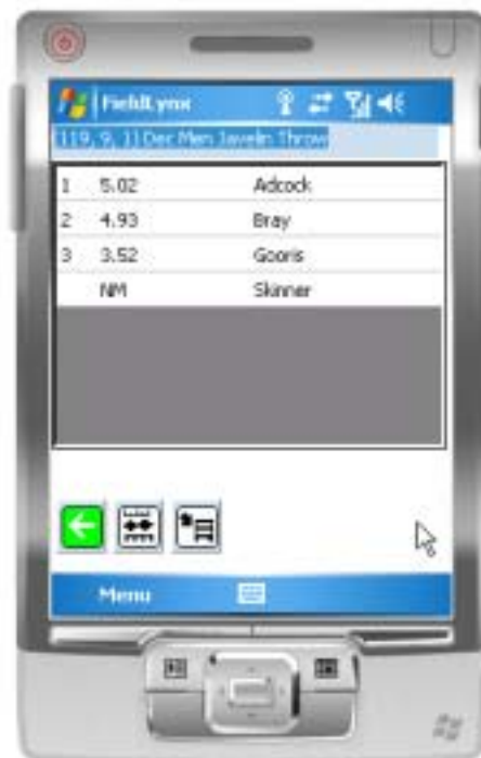
35 - Metric marks displayed in place ord...