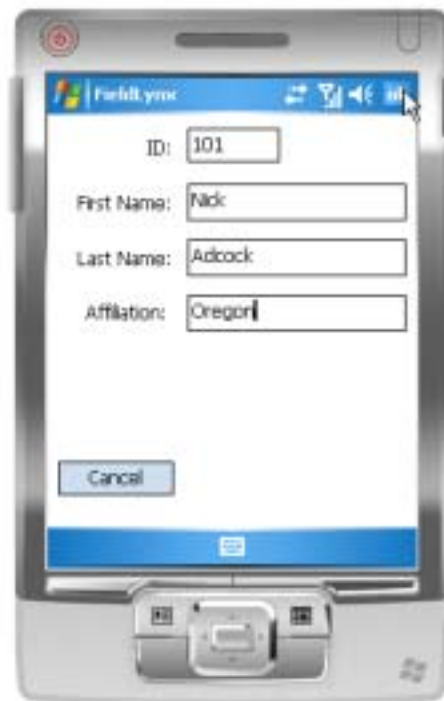
14 - Enter new athlete and details