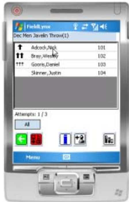
25 - All athletes checked in. Nick is up.