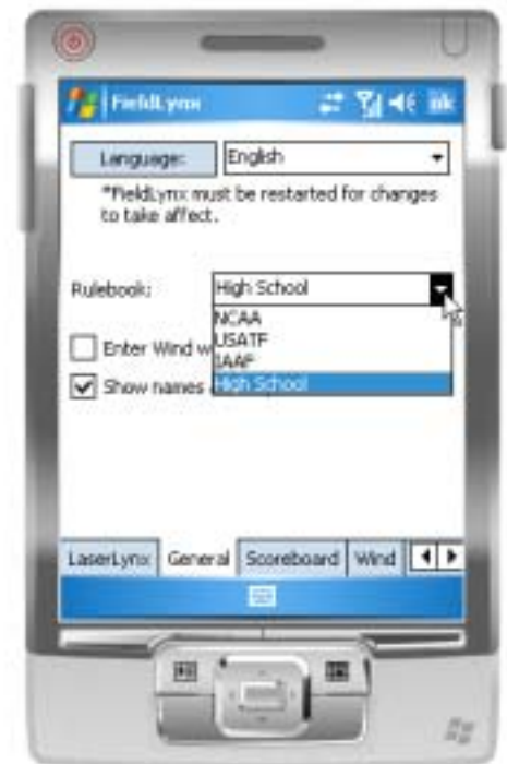
06 - Select which rulebook to use