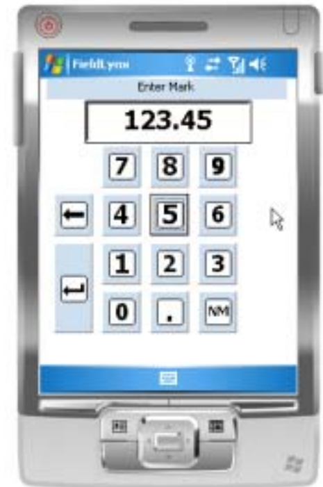
27 - Enter the mark manually...