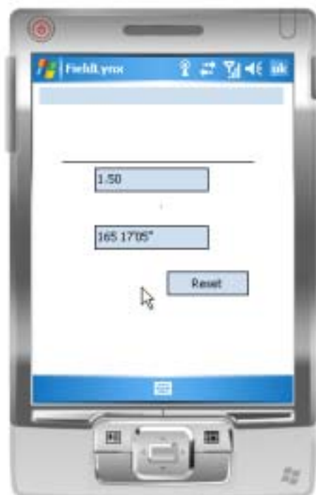
22 - Control settings are ready