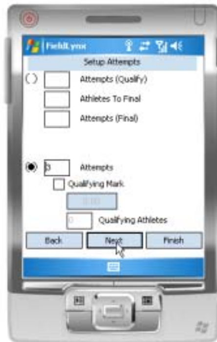
17 - Set number of attempts