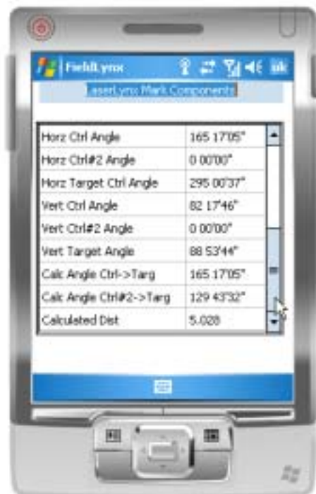
34 - Throw may be reconstructed with co...