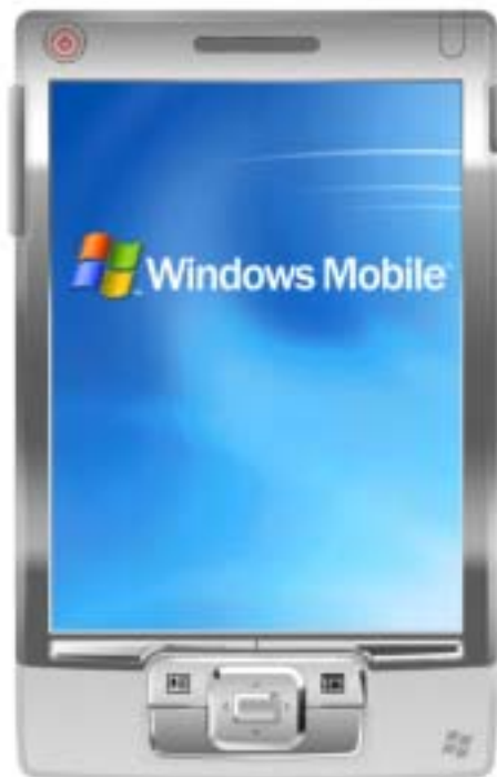
01 - Turn on the PocketPC