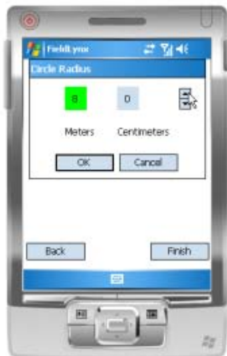
19 - Set the circle radius