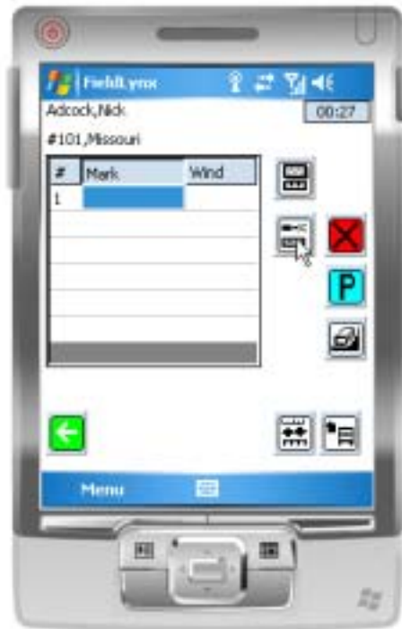
28 - ... or click laser measurement