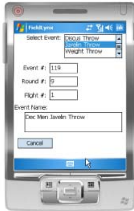
11 - Select event and enter details