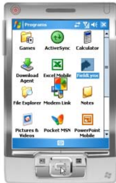
02 - Select the FieldLynx icon