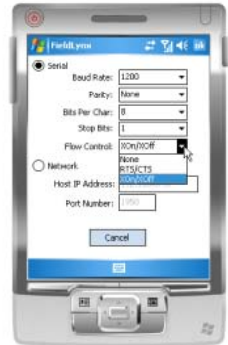
09 - Check the communication settings