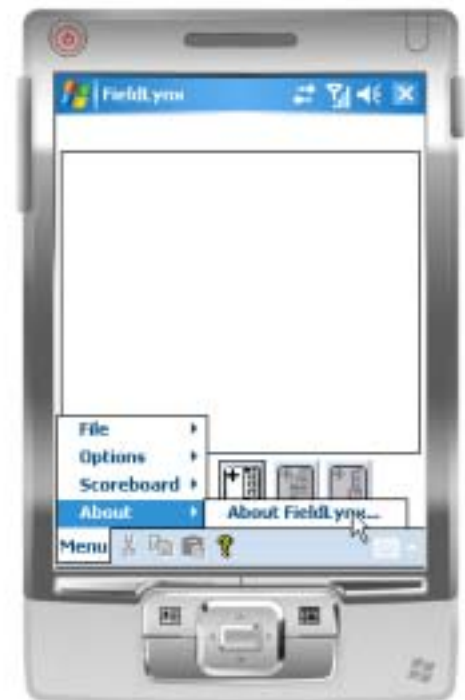
03 - Check FL plugins