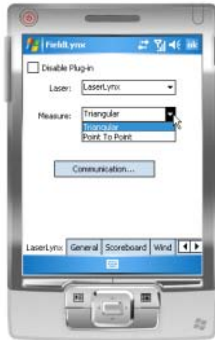
08 - Set for Triangular measurement