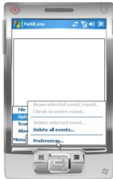
05 - Check FL Preferences