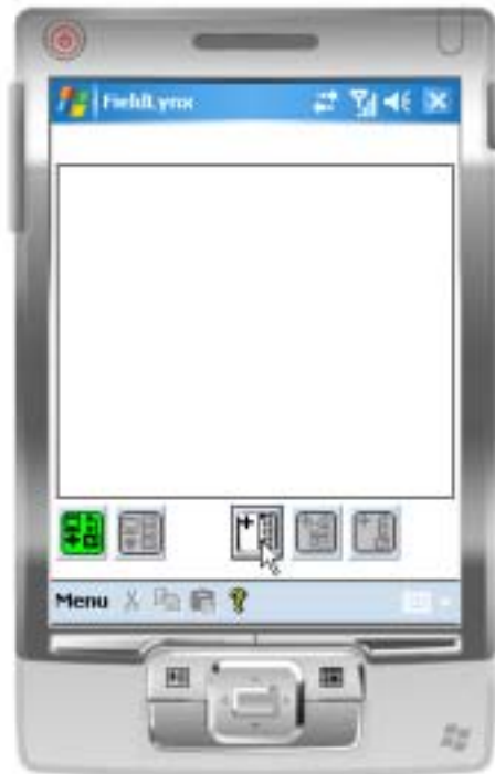
10 - Ready to add a new event