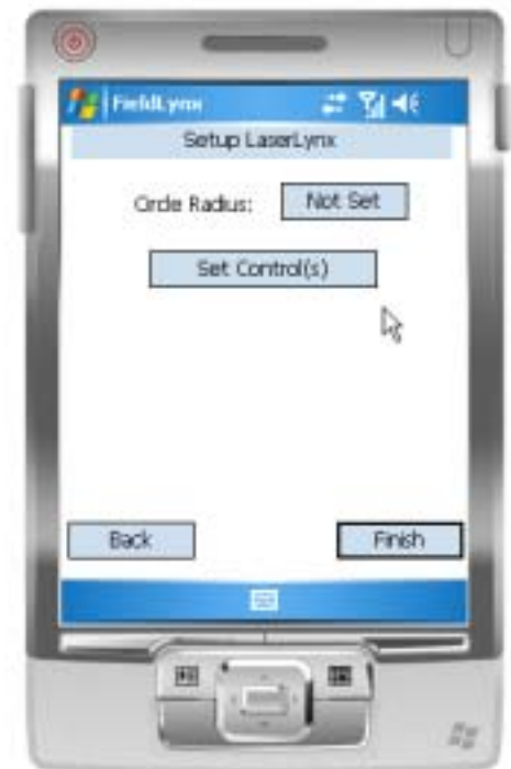
18 - Set LaserLynx controls