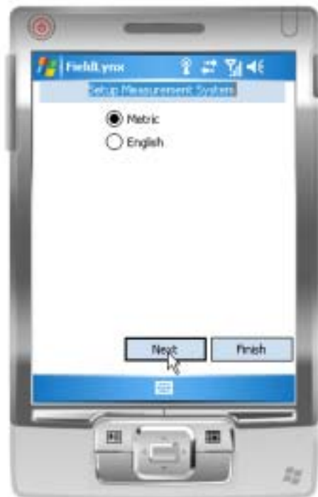
16 - Set Metric or English