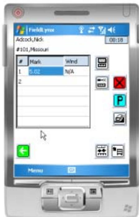
31 - The mark is displayed