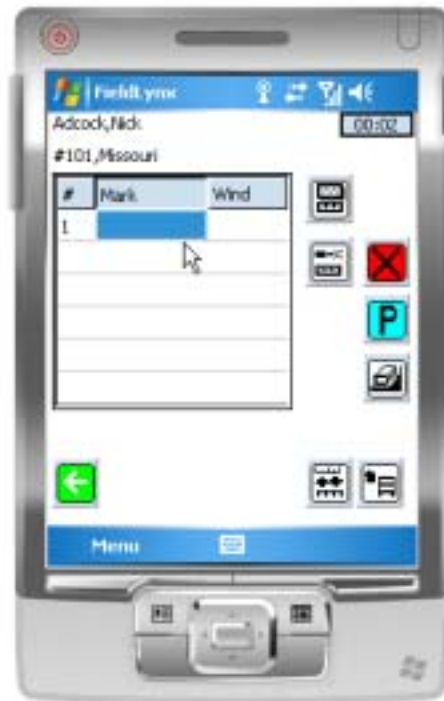
26 - Nick's mark is entered here