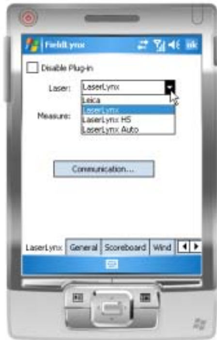
07 - Select the LaserLynx Total Station