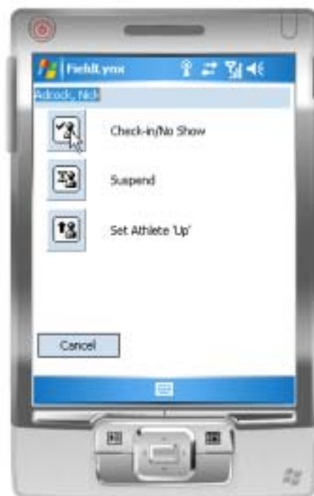
23 - Check in the athletes