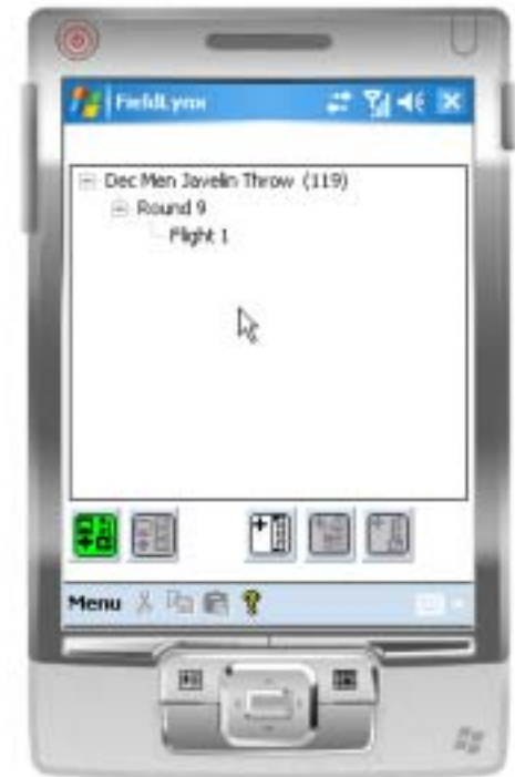
12 - New event has been created