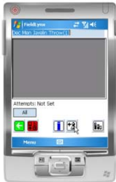
13 - Add athletes