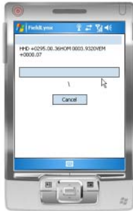
29 - Data is transferred from the total st...