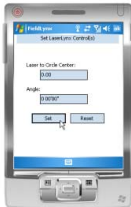
20 - Click Set to get data from total station