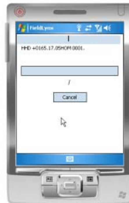
21 - Data is automatically transferred to t...