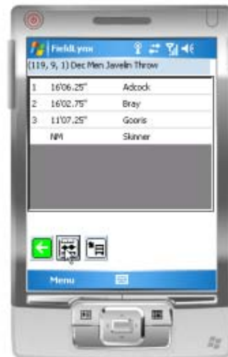
36 - ... and may be displayed in English